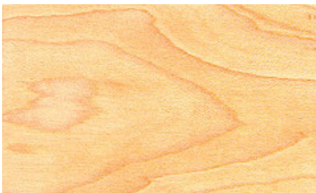
Sheathing Plywood Home Depot Model # 915378