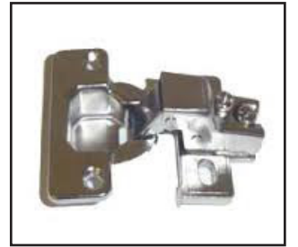
Cabinet Hinges Home Depot Model # ET-H-N

Materials for this design include sheathing plywood, covered in a weather and water proof stain. This allows the wood to show its natural grain and keeps the design simple for a small town look. The windows inset into the doors will be made out of clear exterior resin, a sustainable and plastic like material that will protect the books from the weather. The construction is basic with common cabinet hinges.