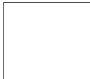
Crystal Clear Resin 3Form Exterior Finish