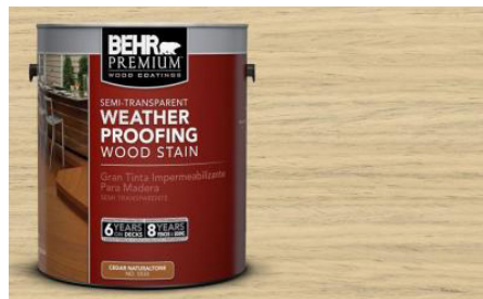
Weatherproof Stain Home Depot Model # 507701